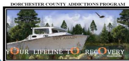
Dorchester County Addictions Program

If you should fall or if you feel in danger of relapse, we are here to help you get back on your feet again!