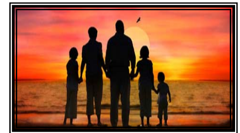
Dorchester County Addictions Program